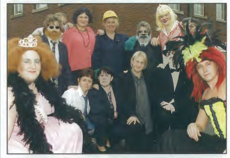
Cross-dresser on parade at Pentre Bychan.