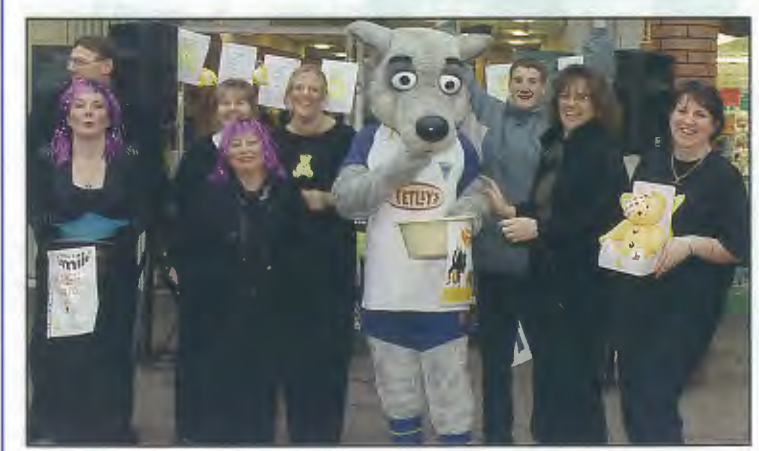
Karaoke singer and Wolfie at Warrington CSC.