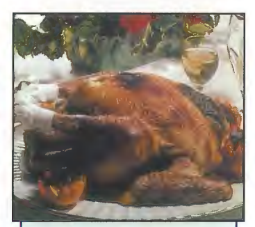
A tasty celebration of Thanksgiving in style.

Staff from Powers Systems in Prenton, the police, the fire service, the road safety unit, the NSPCC and drug awareness groups attended over a period of two weeks. The sessions. organised by Manweb and Warrington Borough Council, sent out the message that electrical safety is crucial at all times.