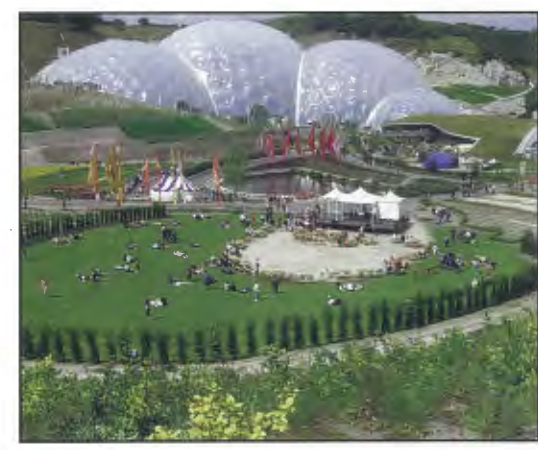
View of the arena at the Eden Project, Cornwall,

You will stay at the top value Tregurrian Hotel, sited just yards away from Watergate Bay and four miles from Newquay. All the bedrooms at the